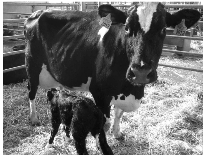
Figure 1. Cows are highly susceptible to disorders like metritis during the weeks after calving.

To explore the long-term consequence of metritis, data from two previous transition cow studies were combined. Using only data from multiparous cows a population of 43 healthy animals (no fever or other clinical signs of disease by 21 days post-partum) and 16 metritic animals (had a fetid, foul smelling vaginal discharge, with a fever greater than 39.5°C by 21 d postpartum) were identified. Individual animal DMI was monitored for 21 days after calving for all experimental animals using an electronic feeding