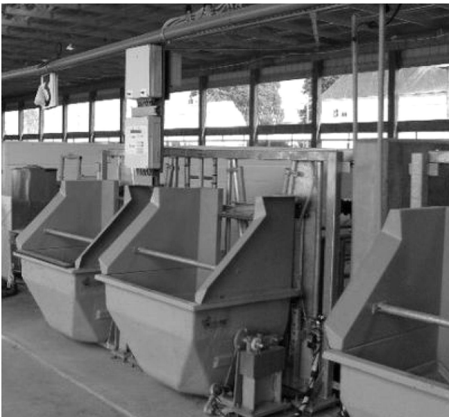
Figure 1: Electronically controlled feed bins used to study the feeding behaviour of growing heifers.

For all three experiments, electronic feed bins were used that identify individual heifers housed in a group pen and record the timing and amount of feed eaten during each visit to a feed bin (Figure 1). Feed samples were also taken to determine if heifers preferentially selected certain components of a total mixed-ration.