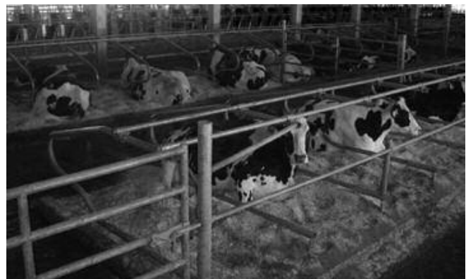
Figure 1. Testing cow preferences. In this phase of the study cows had the choice between stalls with kiln-dried sawdust, and the same bedding soaked in water. The wet and dry stalls were arranged in a checkerboard pattern. Sure enough, this is how the cows choose their stalls - consistently avoiding the ones with wet bedding.

Maintaining lying times is a priority for dairy cattle; cattle will forgo eating to increase lying times. Cows can cope with some restrictions in lying times by changing body posture to alleviate strain on the legs and hooves while standing, but their motivation to lie down increases after only a few hours of standing. Restricted lying times also increases blood cortisol and other measures of physiological stress. In this study, we used two well-established measures of cow comfort; a test of preference in which cows were allowed to choose between wet and dry stalls, and a test of stall usage in which cows were provided access to only one option at a time.