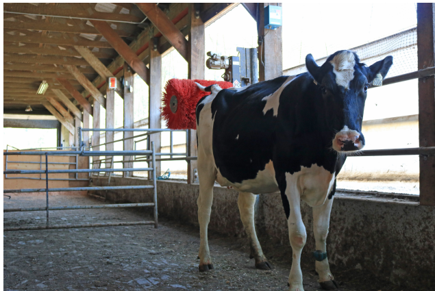
Figure 1. Cow with automated mechanical brush at the UBC Dairy Education and Research Centre.

Grooming behavior is expressed by many animals, including cows, and helps them maintain a healthy coat and skin. Cows can groom themselves and herd mates by licking. When housed in naturalistic environments, they also use trees or other structures to scratch parts of their body that are otherwise difficult to reach. On some dairy farms cows do not have access to surfaces suitable for scratching themselves, but other farms are now providing cows with automated mechanical brushes that facilitate grooming behavior (Figure 1).