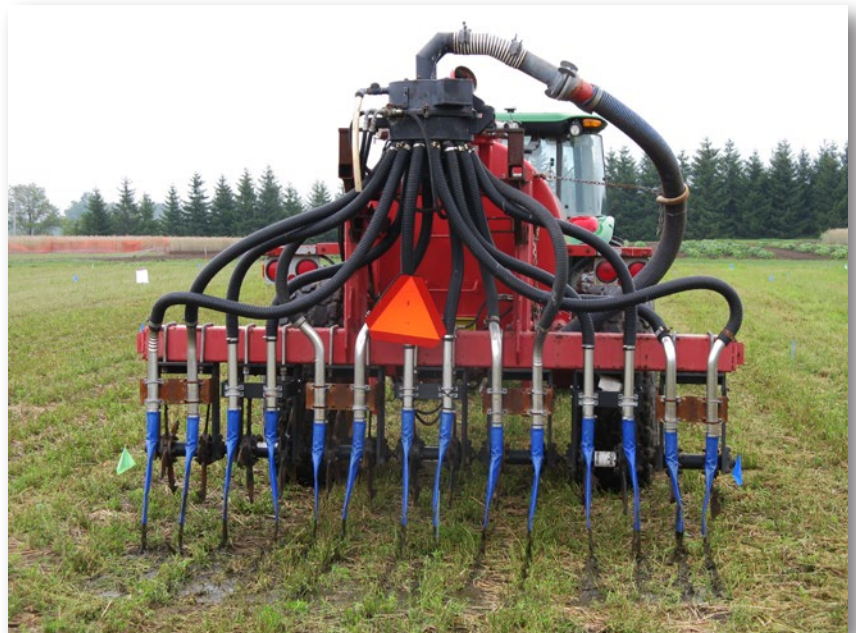
Tool bar equipped with rolling tine and drop hose used to vary method and rate of manure application in the research scale experiment

The amount of K removed in the forage cut from the fields with manure or fertilizer applications was greater than from forage cut from fields with no nutrients applied. If manure was not applied to every cut, soil test K levels declined substantially, showing the high K removal capacity of alfalfa.