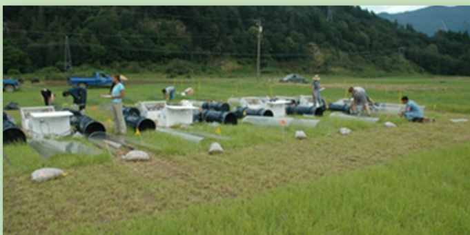
Figure 2. Experimental setup for studying ammonia emission with wind tunnels.

References available online at www.farmwest.com