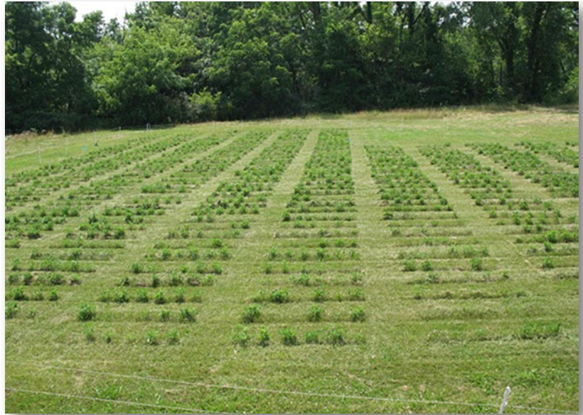
Figure 2. Many breeders use other species as competitors in their selection nurseries, illustrated with alfalfa plants undergoing selection in a fine-fescue sod.

To operate on such a scale requires the use of surrogate traits to predict forage quality of individual plants and