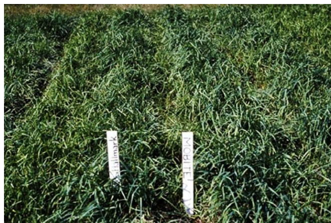
Figure 1. Alternate double row planting of an early (Hallmark) and late (Mobite) maturing variety of orchardgrass. Hallmark is more blue green and Mobite is more lime green in colour.